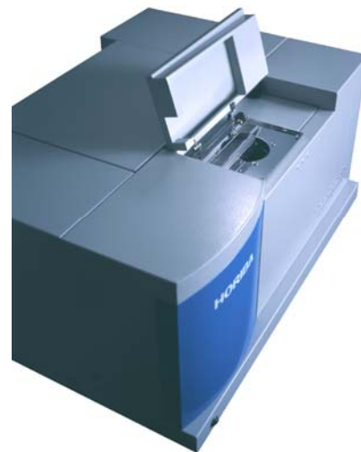
LA-930 Particle Size Analyzer

Horiba's LA-910 and LA-930 particle size analyzers have proven particularly popular for this application with numerous installations in the industry. The stability, broad size range, and ease-of-use make it ideally suited to the quality control in the manufacturing process.